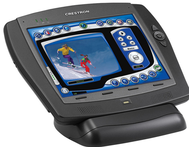
SHOWN WITH OPTIONAL DOCKING STATION

VNC Viewer support delivers enhanced cross-platform interaction with remote computers over the network or Internet, allowing access and control of desktop applications with live presentation capability.